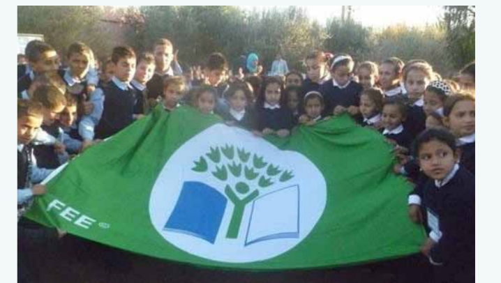
The Green Flag, awarded to six schools during the 2011-2012 school year, a real reason to be proud of the school.

A group of students from three schools in Salé visited the Swiss solar aircraft Solar Impulse, which made a stopover in Rabat.