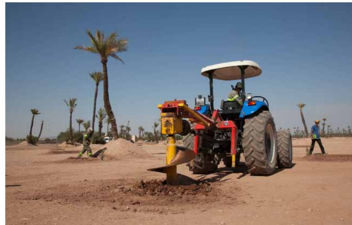
Planting operations are now highly organized and mechanized. They have to reach and exceed targets set by the safeguard program.

An analysis of existing regulatory texts and the administrative procedures to follow for the listing process was conducted. Updated environmental data is a key step in this listing process. The terms of reference and a list of technical specifications were written