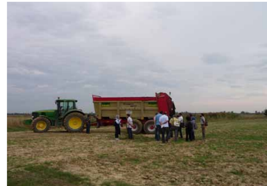
The recovery of sludge of the purification station in large of Nador in agriculture is a flagship achievement of this program.

Most notably is the pilot plot for the agricultural use of sludge from the treatment station for the greater Nador region in October 2012.