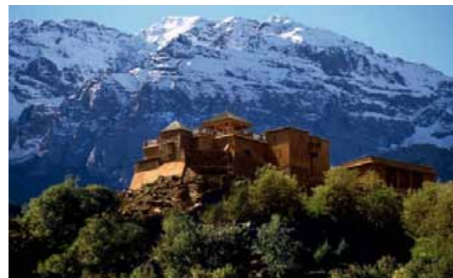
The Green Key label interested the establishments in mountain areas

The Foundation has developed an in-house guide on the Green Key portal for labeled accommodation establishments, which is for tourism professionals and the general public. It presents the portal topics, online registration of candidates, account creation, a test for compliance with the label requirements and best practices.