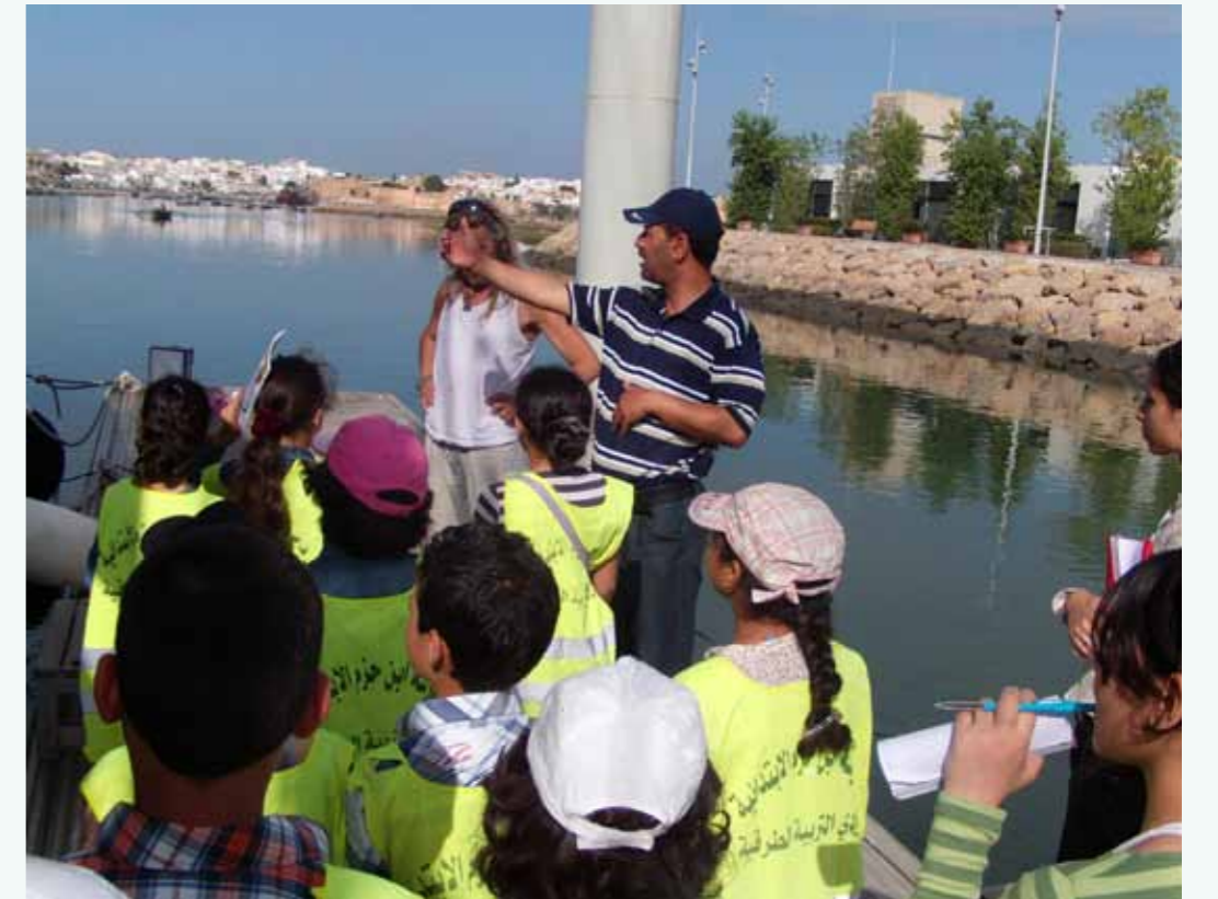
The Eco-Schools program involves stakeholders who explain environmental issues to schoolchildren.

■ 24 students of the Eco-Schools program visited an eco-ship