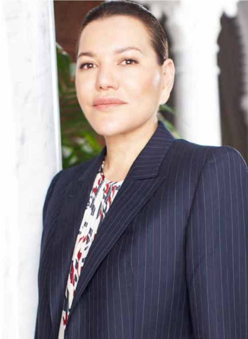
Her Royal Highness Princess Lalla Hasnaa President of the MohamedVI Foundation for Environmental Protection