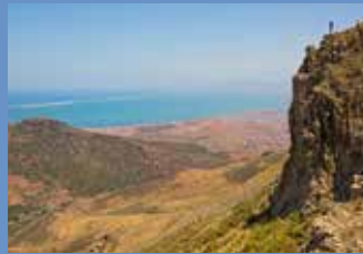
INTERCONTINENTAL BIOSPHERE RESERVE OF THE MEDITERRANEAN (RBIM)