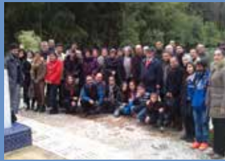
YOUNG REPORTERS FOR THE ENVIRONMENT (YRE) 12TH EDITION OF THE COMPETITION