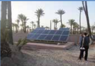
VOLUNTARY CARBON OFFSETTING