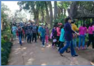
HISTORIC PARKS AND GARDENS