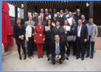
CAPACITY BUILDING OF YOUNG ENVIRONMENTAL COMMUNICATION PROFESSIONALS