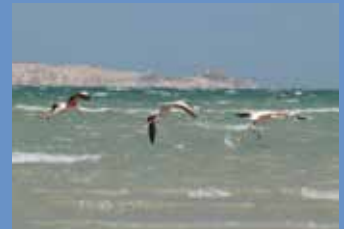
OUED DAHAB BAY