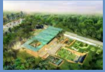
ENVIRONMENTAL EDUCATION CENTER (EEC)