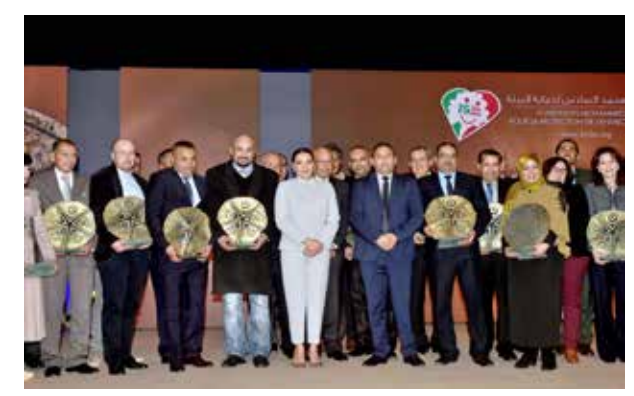
Skhirat - March 06, 2017 : HRH Princess Lalla Hasnaa Chairs Awarding Ceremony of 2nd 'Lalla Hasnaa Sustainable Coast Trophies'

Participation in the second Lalla Hasnaa Sustainable Coast Awards was markedly increased, with 109 candidacies submitted. This enthusiasm reflects a true commitment to environmental protection by the entire public with whom the Foundation has been working to raise awareness and educate.