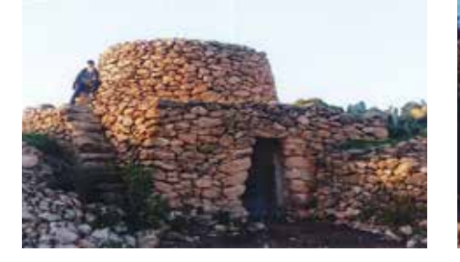
Tazota El Massab Middle school ( El Jadida ) Casablanca Settat Academy 15-18-year-olds - Local heritage award