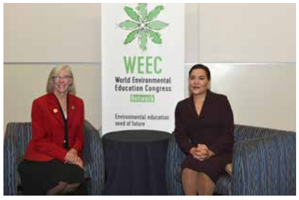
WEEC2017- Vancouver, September 09, 2017: HRH Princess Lalla Hasnaa received by the Honorable Judith Guichon, Governor of British Columbia, Queen's Representative.

The Foundation participated in plenary sessions, workshops and side events of this 9th edition of WEEC.