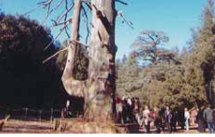
The old tree Omar Ibn Aziz Middle school ( Ifrane ) Fès Meknès Academy 15-18-year-olds- Resistance award