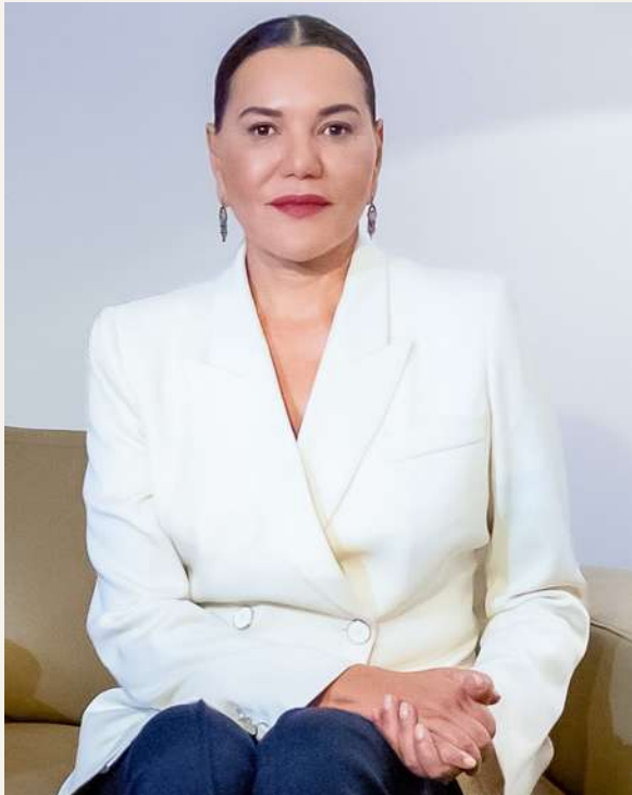
Her Royal Highness Princess Lalla Hasnaa

President of the Mohammed VI Foundation for Environmental protection