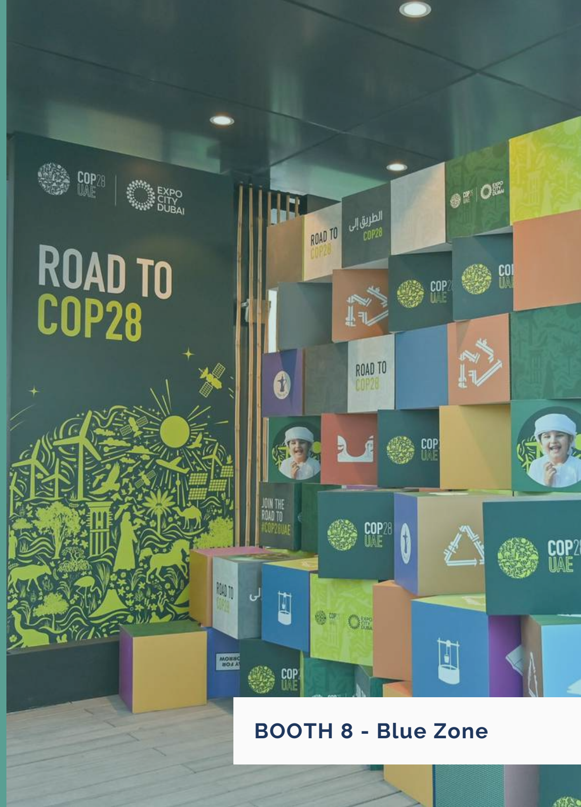
BOOTH 8 - Blue Zone